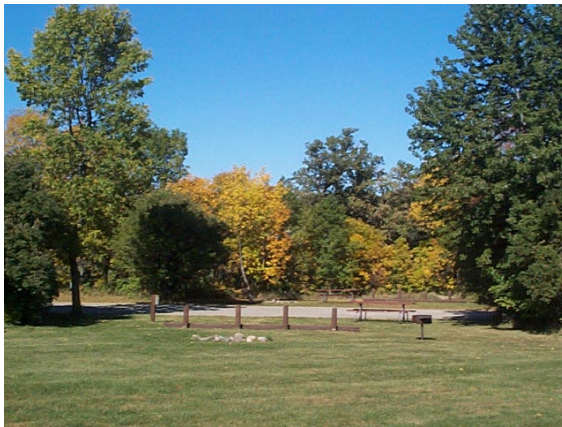
Lake Hanska County Park Campground

The Park contains paved walkways leading to the picnic shelters, along with other features making the facility handicapped accessible.